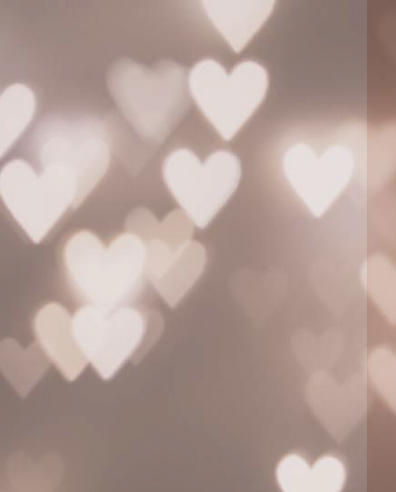
Illustration: Marriage: Love can make it easy.